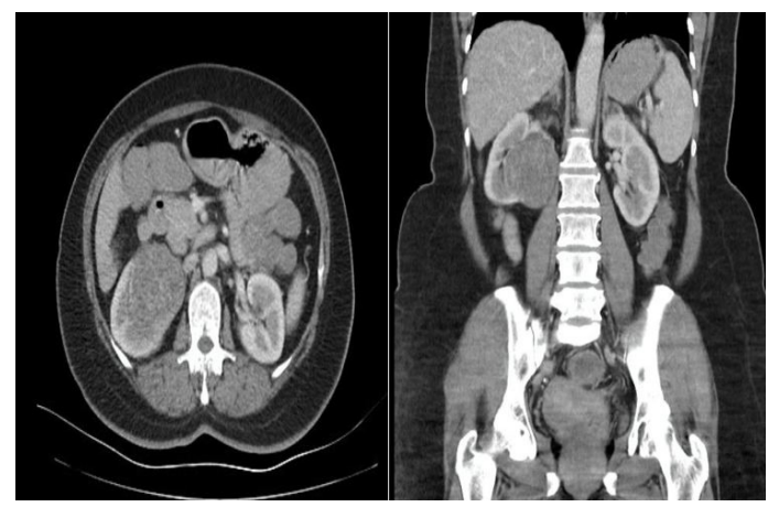
Figure 1. CT revealed a solid lesion which showed exophytic extension from the middle zone of the right kidney to the lower pole and which was sharply demarcated, 58x70 mm in size

was admitted with an abdominal MRI taken in a public hospital in his province 8 months later. Her MRI revealed a heterogeneous mass lesion of approximately 76x76x80 mm in size, with irregular lobulated contours involving middle-lower part of the right kidney and renal pelvis and extending into the opening of the renal vein into the VCI by invading the renal vein. After intravenous injection of the contrast agent, a heterogeneous enhancement in the mass lesion was observed. Renal parenchyma got thinner due to the mass lesion (PADUA score 11). Based on radiological findings, the patient was informed that RCC was suspected, and clinical evaluation or excision was recommended (Figure 2). In this stage, open radical