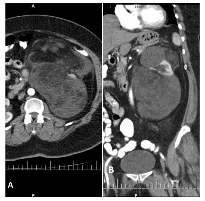
Figure 1. A- Contrast-enhanced abdominal computed tomography (CT) in the axial plane showing a large tumor in the abdomen B- Contrast enhanced CT scan in the coronal plane showing large tumor surrounding the left kidney

A 66-year-old female was admitted to our clinic with abdominal pain. On physical examination a hard, non-mobile mass extending from the bottom of the left costal margin towards the inguinal region was palpated. Contrast-enhanced abdominal computed tomography (CT) was performed. A 25x16 cm sarcoma mass surrounding the left kidney was detected on CT, and the operation was planned (Figure 1). The patient was operated through a left semi-chevron incision. It was observed that the left kidney was completely surrounded by the mass. The mass and the left kidney were removed together (Figure 2). The operation time was 170 min and the estimated blood loss was 250 ml. No perioperative complication occured. The patient was discharged on the 4th postoperative day. The histopathologocical evaluation revealed a well-differentiated liposarcoma with a size of 25x16x12 cm (Figure 3). Neoadjuvant and/or adjuvant radiotherapy and chemotherapy were not given