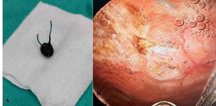
Figure 3. A: Removed hanging bladder stone B: Appearance at the end of the surgery