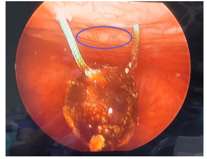
Figure 2. A hanging bladder stone and suspicious lesion (blue circle) at the dome of bladder