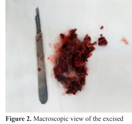
right adrenal gland