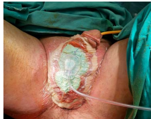
Figure 3. Vacuum device placement after surgery