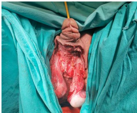
Figure 2. Vital tissues after surgical debridements