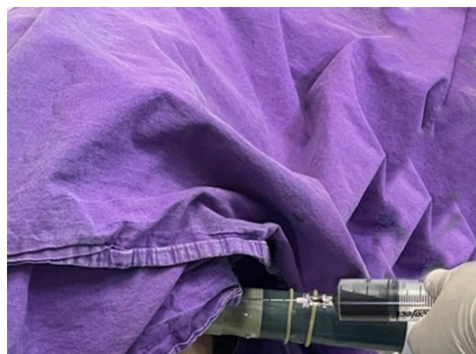
Figure 3. Dark-colored aspirated liquid of cystic lesion

developed, transrectal needle aspiration was performed under the guidance of transrectal US ( Figure 2a ). Cystic dilatation regressed completely after aspiration ( Figure 2b ) of a dark-colored liquid ( Figure 3 ). The urethral catheter was removed at the 24th hour after percutaneous aspiration. The patient was discharged after he urinated without difficulty. A control visit was scheduled for approximately one month after the procedure.